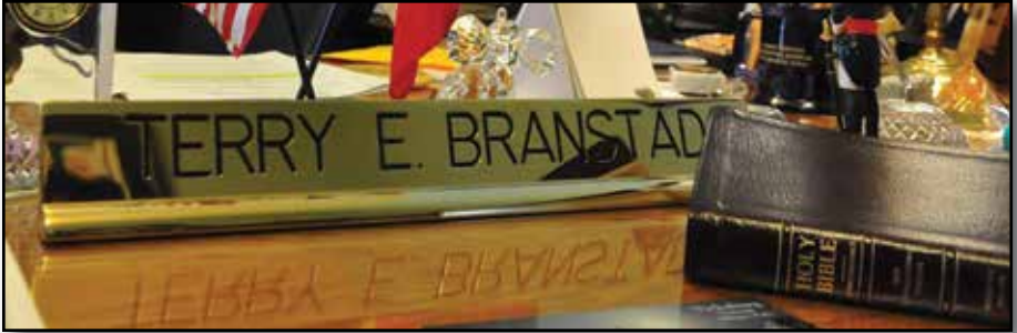
The above Bible was used at this year's inauguration by the Governor.

For more than half a century, the Iowa Prayer Breakfast continues to be a long-standing tradition where Iowa's Governor, legislators, community and religious leaders join the public in asking God's direction and blessing upon our state.