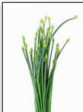
Organic Garlic Chives